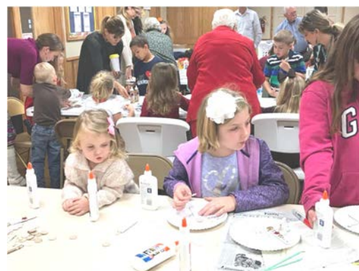
At the second annual Advent Workshop, youth gathered to create special Advent ornaments, an alternative approach to the traditional Advent wreath.

Youth and adults worked together to create Advent ornaments that coincide with characters from this year's theme carol, "Do You Hear What I Hear?"—ornaments included: a star, lyrical angel, silver cross, and baby Jesus.