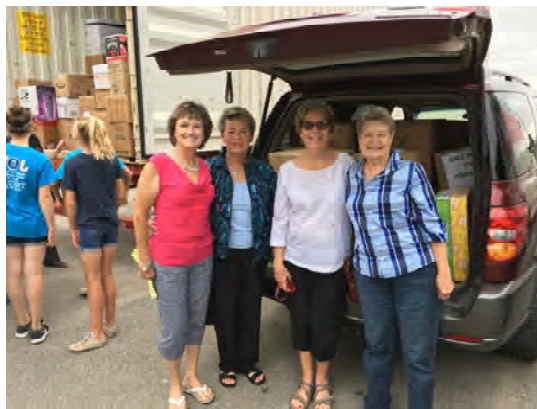
St. Peter's contributed 102 quilts, 93 school kits, 61 personal care kits, and 37 baby care kits to the April 19, 2017 Lutheran World Relief ingathering at Texas Lutheran University in Seguin.