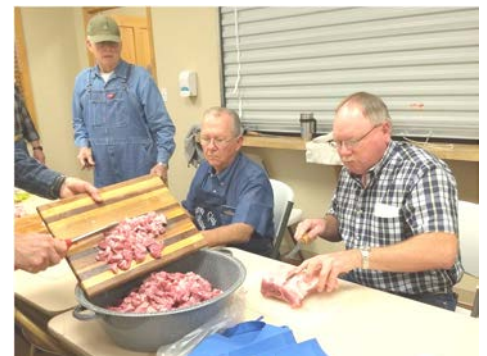
During the March 3 rd Commitment Sunday worship service, we planned how we would financially "Walk With Jesus" during 2019, and then we joined together for St. Peter's annual Stewardship Stew that was prepared by friends and committee members of St. Peter's Stewardship and Finance Committee.

The next Council meeting is set for March 28, 2019 at 6:30p.m.