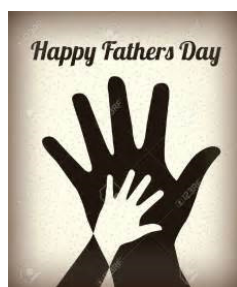
Sunday, June 16, 2019