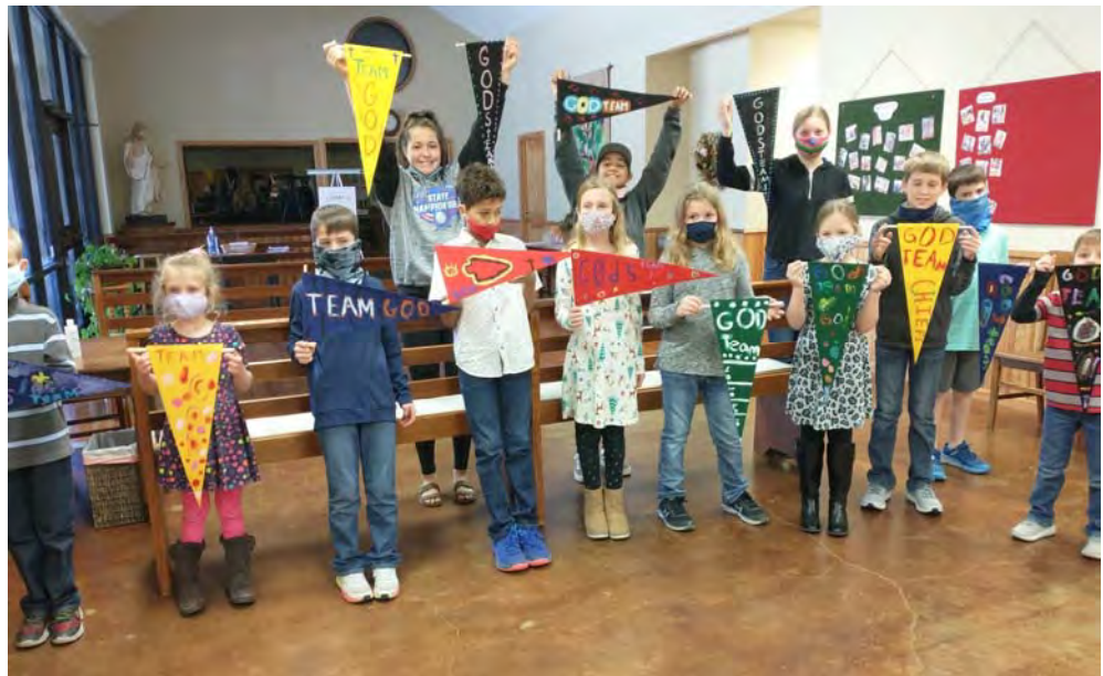
Super Bowl Sunday—God's Team